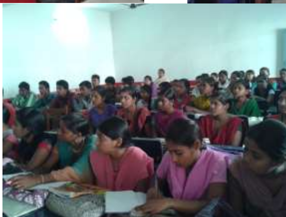
Glimpses of Guest Lecture on Fundamental Rights