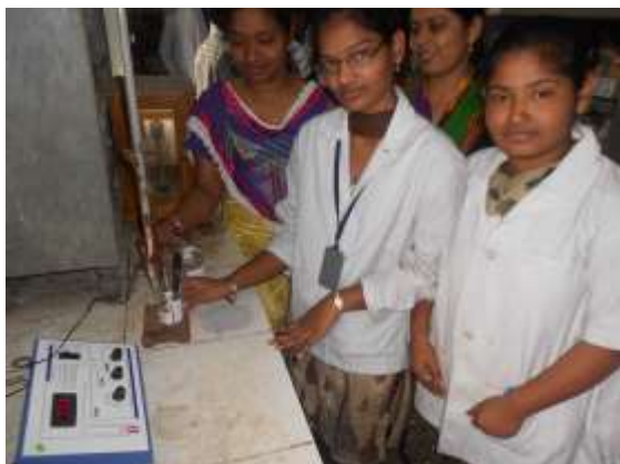
Students in Chemistry Lab