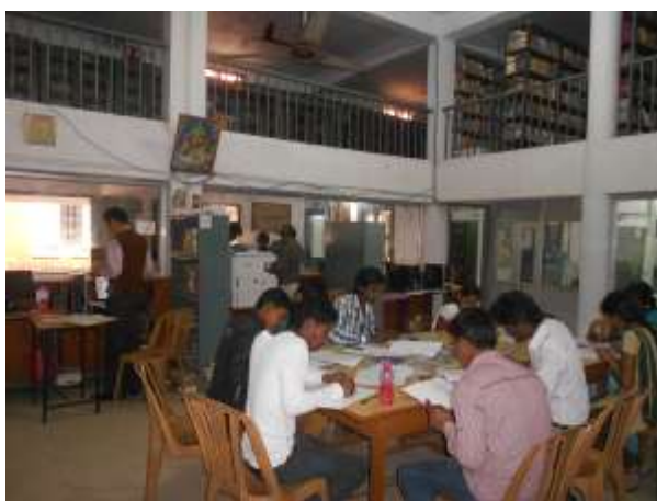
Library Reading Room