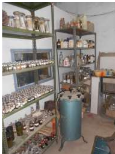
Appratus in Chemistry Lab